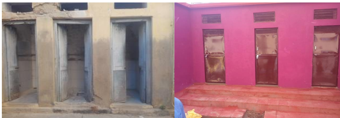
FIGURE 5 RENOVATION OF TOILET BLOCKS IN SCHOOL

In collaboration with National Stock Exchange, FINISH implemented the project in Nashik, Maharashtra by facilitating toilet construction and refurbishment in 9 schools including training and capacity building activities. Completed refurbishment in 9 schools and conducted trainings and capacity building of teachers, Child cabinet and school management committee, successfully facilitated O&M service providers in the selected schools.