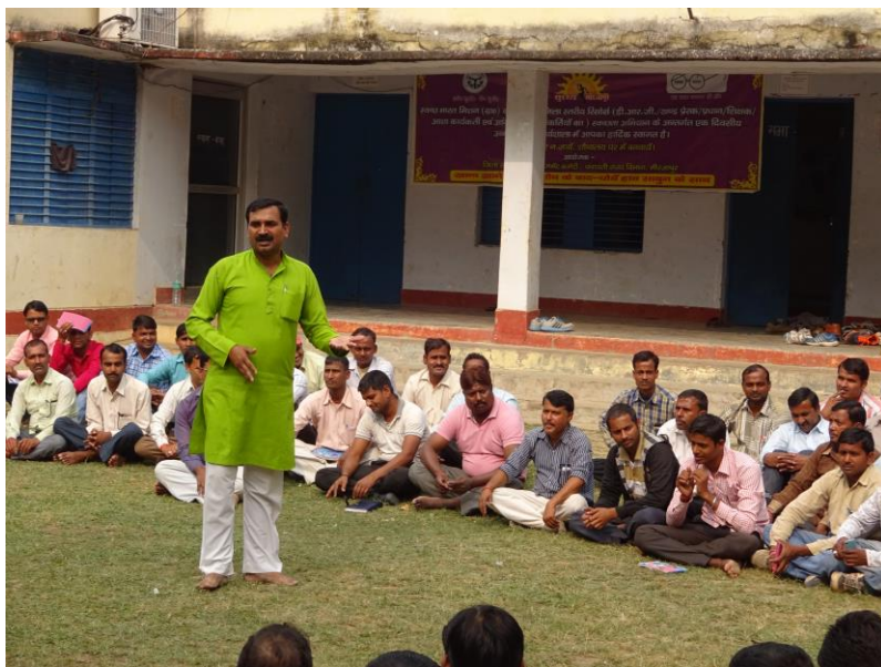
FIGURE 6 CAPACITY BUILDING ACTIVITY

In one of its first direct urban sanitation programs, FINISH Society is working with Dungarpur, Nagar Palika to create awareness and ensure regular toilet usage with CLTS approach. As a part of the project rigorous follow ups and trainings are being conducted. As a result of CLTS, 150 toilets were constructed by the households and were used on daily basis by the family members. The aim is to achieve ODF in coming few months.