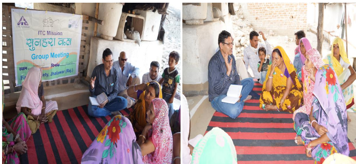
FIGURE 5: EARLY MORNING MEETING WITH BENEFICIARIES.

Community Approaches to Total Sanitation (CATS) Programme in 13 Villages of Kapurthala District is being conducted. Promoting Safe Sanitation for achieving Sustainable ODF is going on in (Blocks- Sunail, Parasali, Dawal, Salari) Jhalawar, Rajasthan