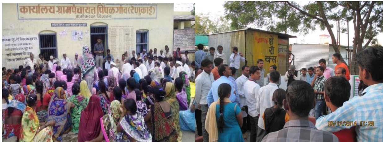
FIGURE 4 CAPACITY BUILDING ACTIVITIES

Under the project demand generation is being done by creating awareness followed by construction of toilets attached with bathroom. As an integral part of our sanitation programs, 10 masons were trained on FINISH training module from the village areas. Till May 2016, 52 toilets with bathrooms were constructed and rest of the systems will be installed by July.