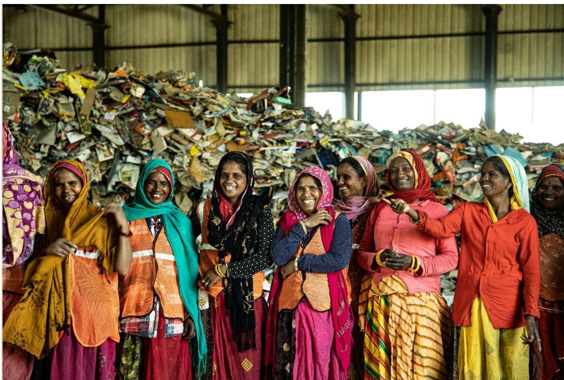
Figure 4 Women waste workers at MRF Centre in Tithardi, Udaipur

Barhat says, “Door to door collection and source segregation is a very challenging task but FS has paved the way. It has inspired other organizations too, to take steps in this direction. As a result of this, the mindset of the people has changed and it is visible because changing the mindset of people is difficult but the work done in this regard is appreciable.” He adds that he values the association and hopes towards a landfill free city by next year end.