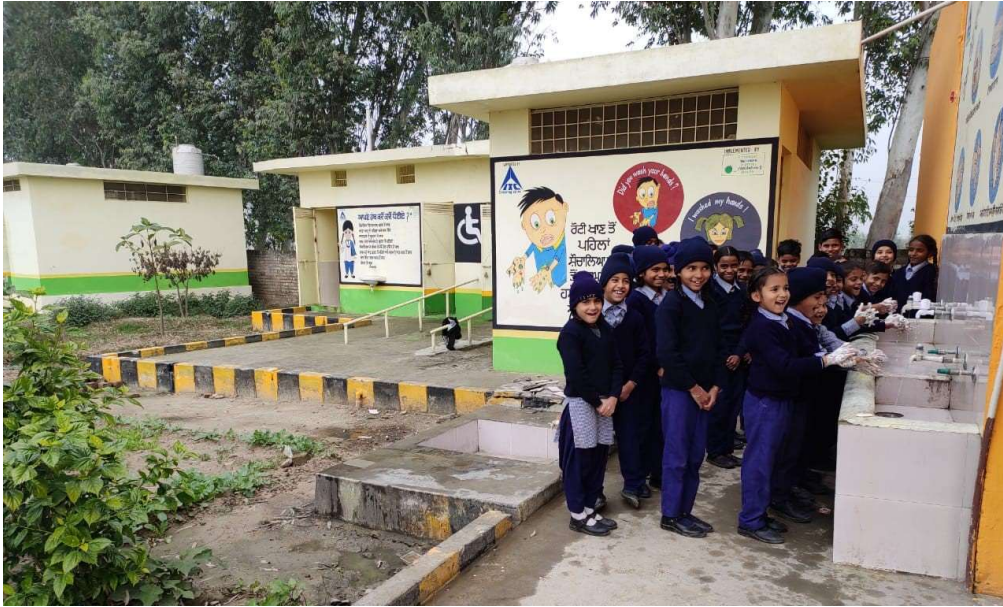
Figure 2 Hand wash and toilet blocks made in Kapurthala School