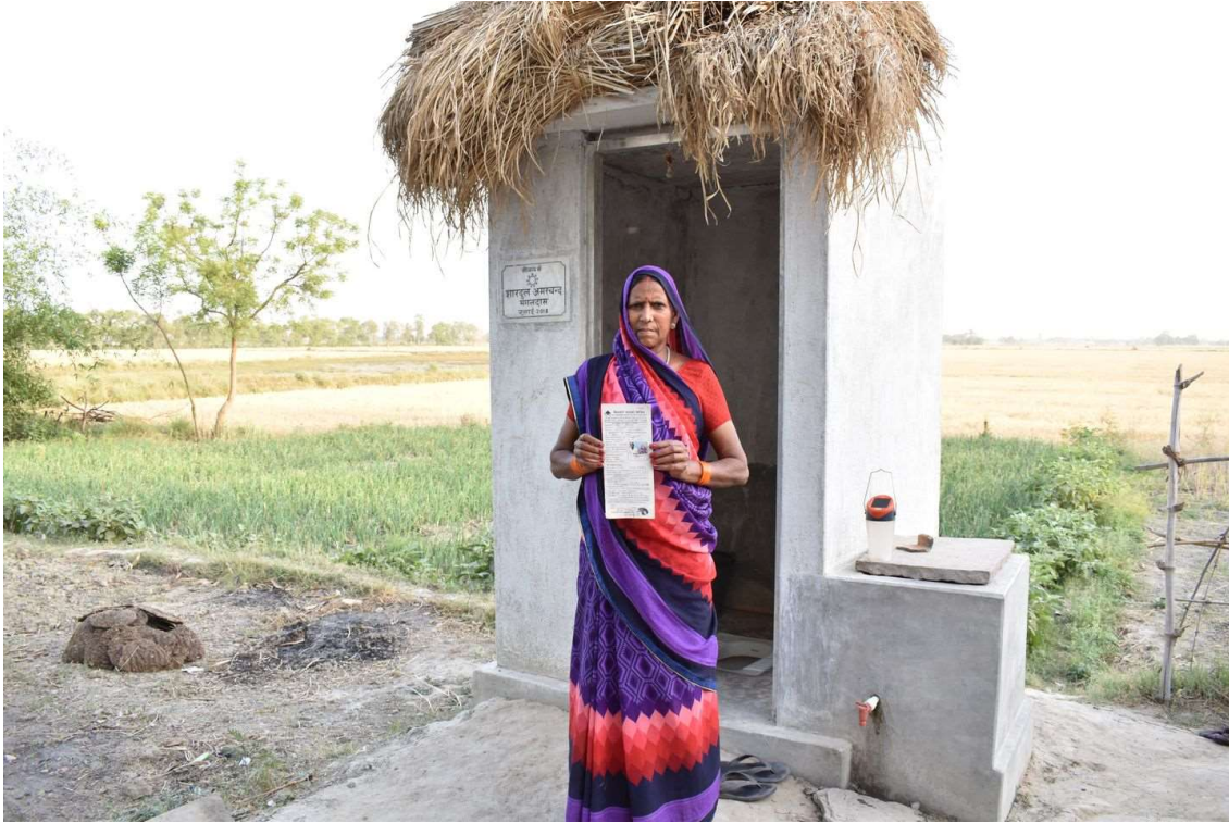
Figure 1 Women holding the loan card with details of the toilet construction.

FINISH Society started with the objective of managing the FINISH programme along with expanding the local partnerships in India. The Society continues to scale up the WASH in communities programme, abiding by the principles of SBM-G Phase II guidelines to ensure that no one is left behind with focus on ODF sustainability, retrofitting, regular usage and safe technology of toilets. In our endeavor to improve access to safe sanitation and hygiene services, FINISH is supported by corporates, Government and aid agencies.