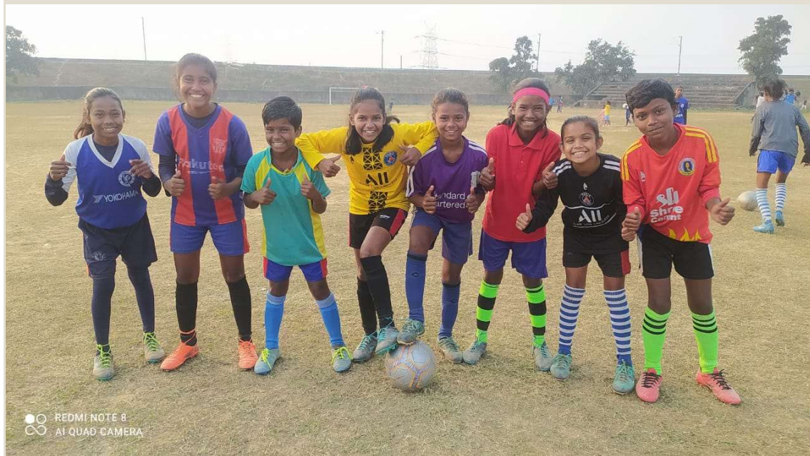
Figure 6 Children posing before starting their football match.

Team work, discipline and healthy competition are three basic tenets of a sports programme, which was recently launched with much fanfare in Dhanbad. You could say it is a case of breaking new