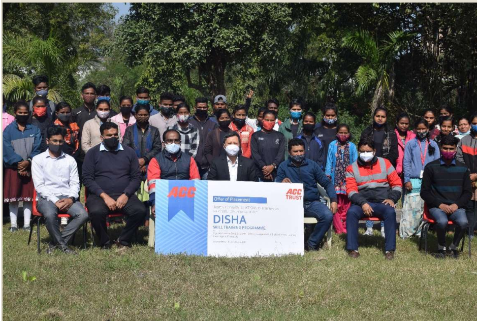
Figure 5 Group photograph of all the candidates who got placements after the training.