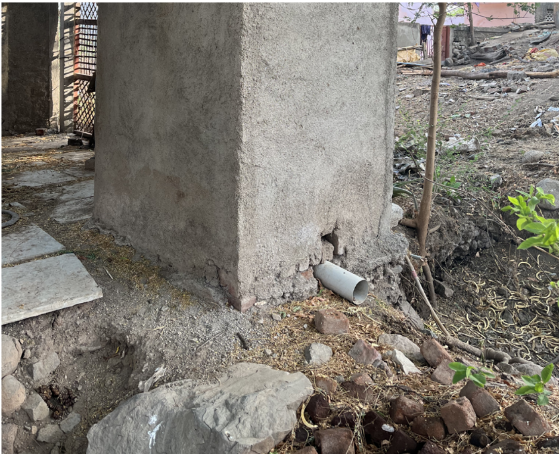
Figure 6: Dysfunctional toilet with outlet not connected to a pit

Masons and some PRI members were unaware of leach pits and their long-term sustainability. Many households who have used their toilets for a few years have a large septic or holding tank attached to the toilet, sometimes just below the toilet structure. Some PRI members and front-line workers have been trained on generating demand for toilets and on the required technology, but training still remains a need.