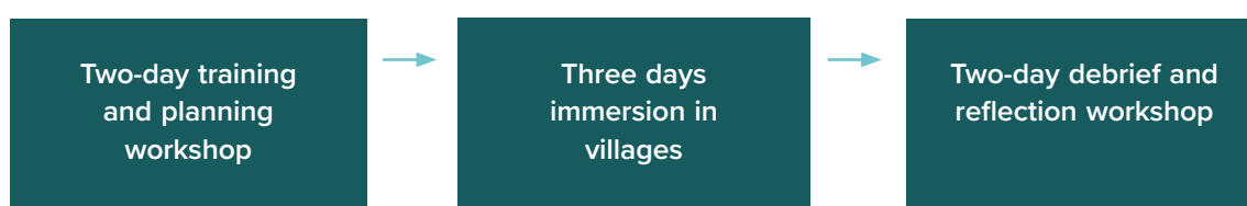
Figure 2: Immersion process

The process was simple, starting with a workshop, moving towards field immersion, and finally a debrief of the findings from the various villages. The following figure presents the steps undertaken. These three steps took place in both districts.