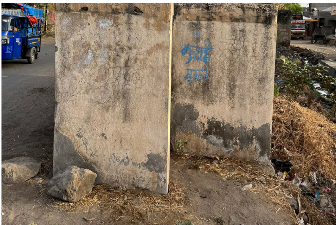
Figure 9: Defunct public urinals, Nandurbar

The availability of skilled masons remains a gap on the service side of the sanitation value chain. Some of the villages have public toilets and urinals, but due to absence of an O&M mechanism, they have become defunct.