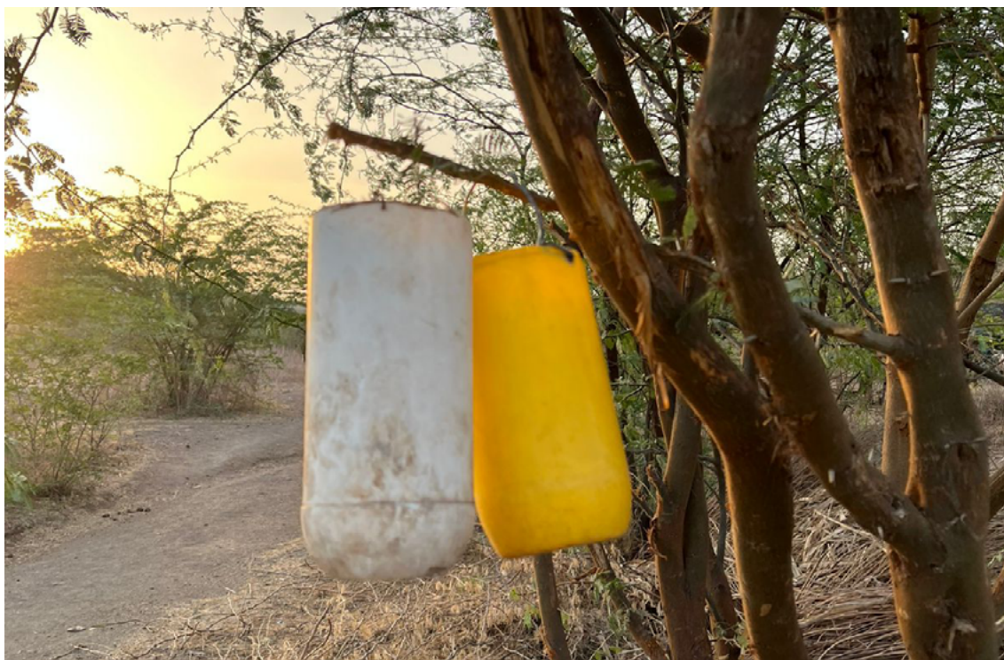
Figure 7: Containers used for OD kept outside a house

Use of toilets is also impacted by local concepts of purity. Tribal members feel that toilets should not be near their homes where they cook, eat, and live. Several elders were observed practicing open defecation. Lotas (small water containers) used for open defecation could be seen hanging in front of many houses.