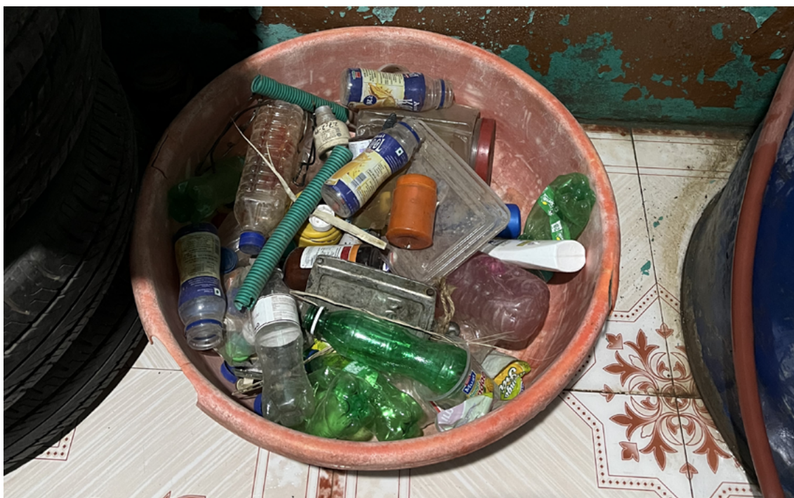
Figure 8: Family stores inorganic waste for selling it to recycler, Nandurbar

Wastewater often flows through the common areas of the villages, but villagers did not express much concern about this issue. While an underground drainage system was found to exist in some parts of the villages, the wastewater (both grey and black) gets mixed into the drainage system and in surface water bodies without treatment. In Village 1, no drainage was observed for the ST communities and wastewater flows into the open. In one village, one household member had constructed a channel to divert the grey water into a soak pit.