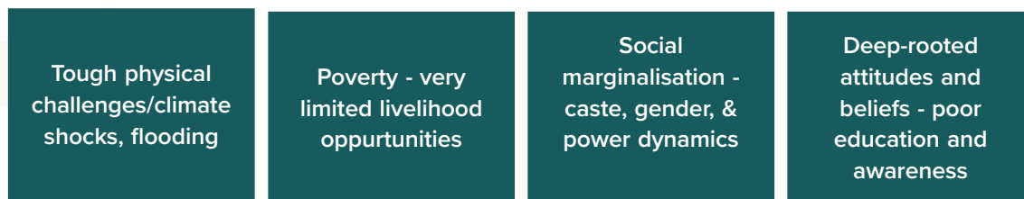
Figure 4: Challenges identified in Darbhanga

The objective of studying the villages in Darbhanga was to understand the gaps and challenges facing universal access to sanitation in the context of these challenges, as summarised in Figure 4.