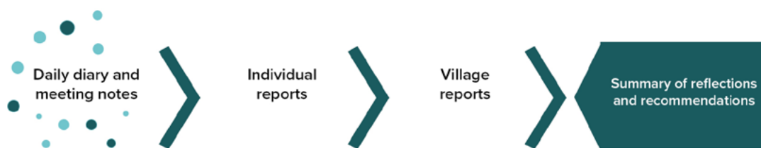
Figure 3: Key steps during the immersion