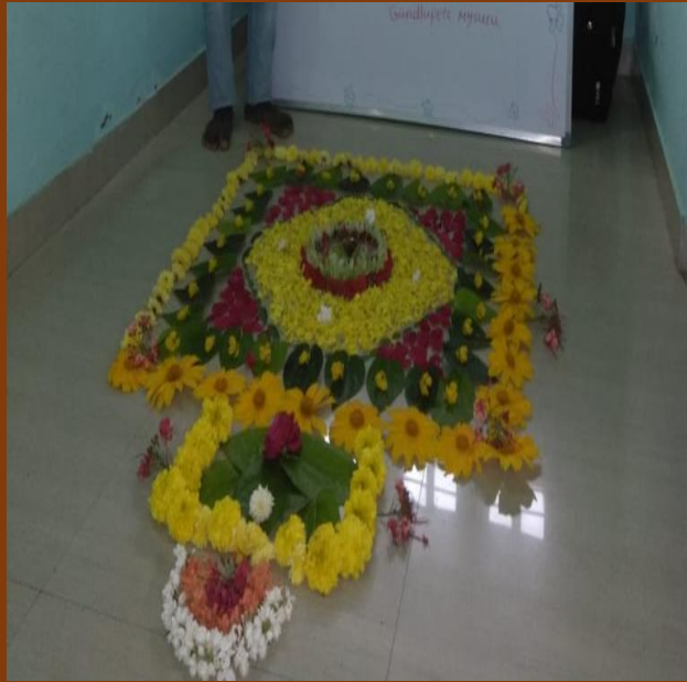
Best Rangoli- FINISH Team Gundlupeth (Karnataka)