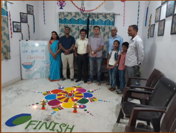
Best Rangoli – FINISH Team Udaipur (Rajasthan)